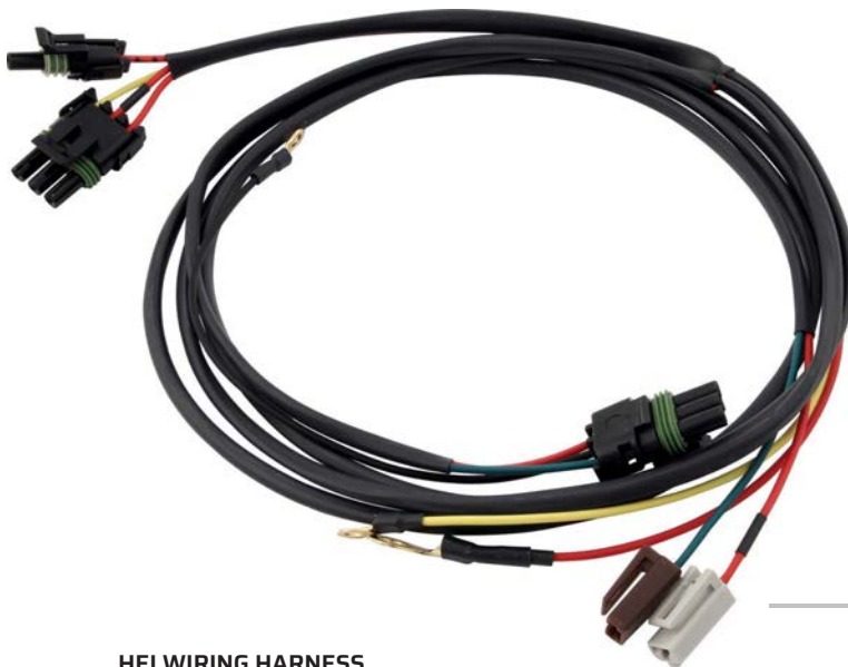
HEI WIRING HARNESS 50-2032