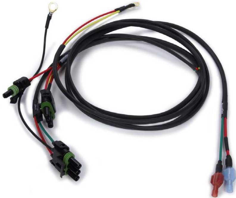
SOFT-TOUCH HEI WIRING HARNESS 50-2039

* Compatible with switch panels in table on Page 97.